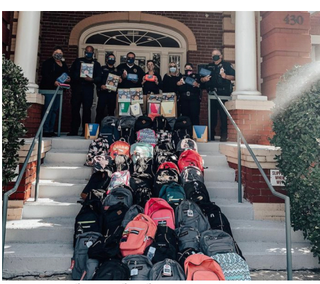
Backpack donations our to students in our district.