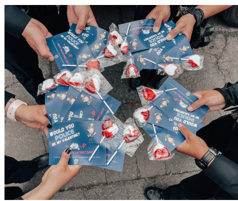
Our "Will you Police be our Valentine" event was a success! Lots of happy little ones!