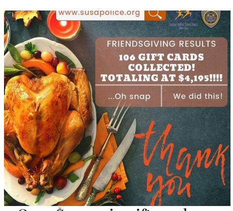
Over $4,000 in gift cards were donation event!